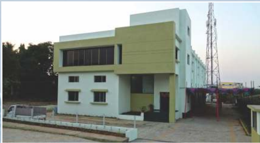
The Factory Site at GIDC, Pardi